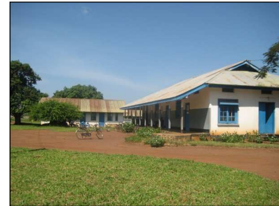
Namungalwe Health Center