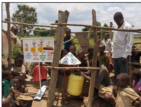
Chlorination dispenser in Bukondo

This year, UVP held village-level outreaches in various parts of Iganga to educate people about the importance of treating water – even if it is collected from a protected source. At these sessions, we discussed many purification options: from boiling water to treating it with a simple chlorination product called WaterGuard, which UVP provides to villagers at a subsidized price.