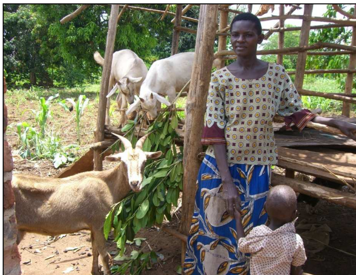
A Kivanyi widow with her goats and son

First, UVP’s Goats for Widows initiative is a source of nutrition for the widows’ families. Given the traditionally high birth rates among rural populations, food scarcity – especially nutrient-rich food – is a common dilemma for Ugandan families. Families with easy access to the vitamins and protein found in milk, however, can enhance their nutritional intake. Therefore, widows with UVP goats can add milk to their families’ diets, helping to fight the widespread malnutrition that exists in Iganga District.