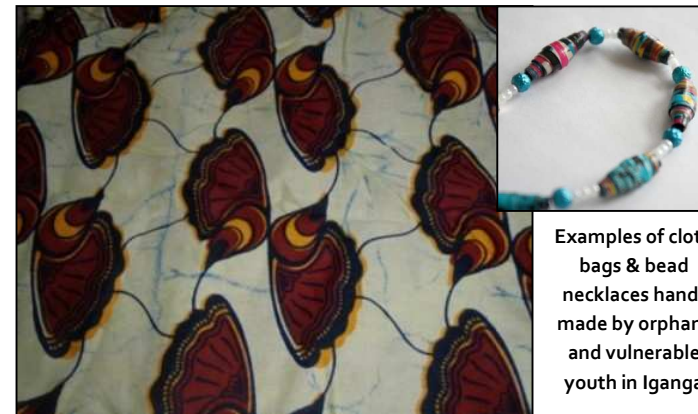
Examples of cloth bags & bead necklaces hand-made by orphans and vulnerable youth in Iganga

In 2009, UVP began promoting hand-made crafts prepared by orphaned students and youth. We purchased backpacks sewn of vibrant, traditional African fabrics from girls who graduated from WAACHA’s tailoring program and resold them in the United States. UVP also bought bead necklaces made by two local Iganga orphanages and promoted them on our website. By selling these items, UVP hopes to boost income generation for these youth.