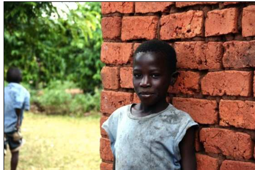
Child in Bugabula B village