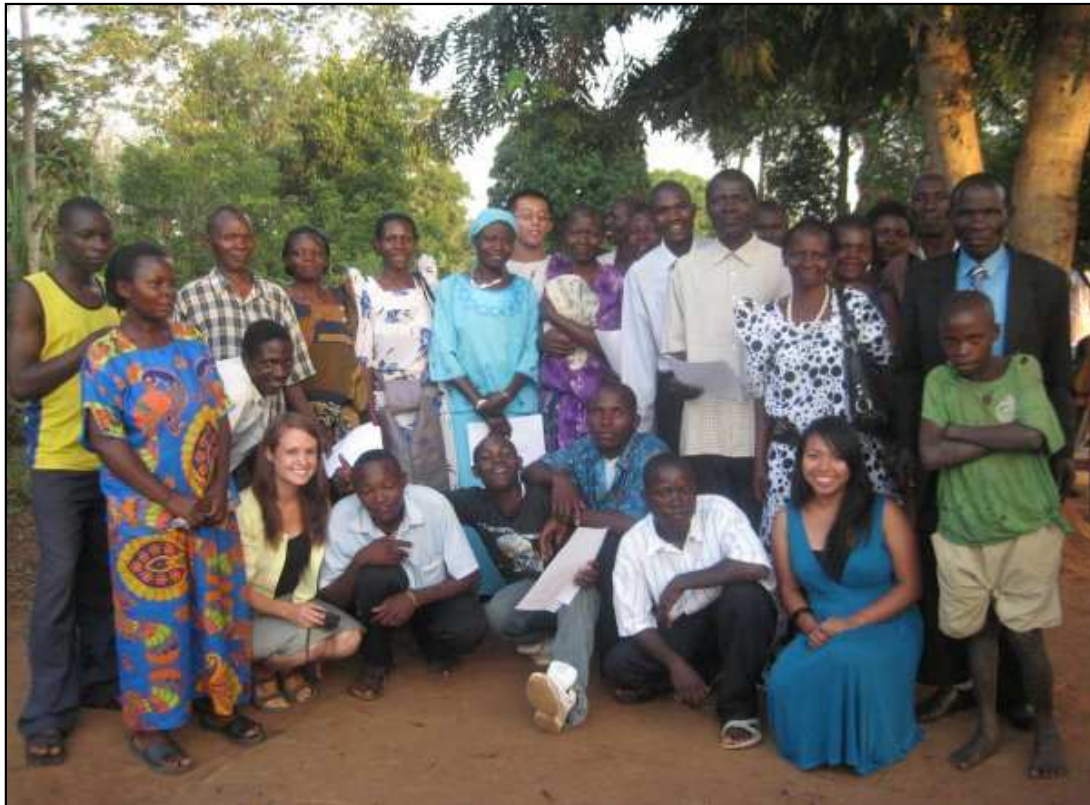
Bulumwaki 1 VHT with UVP summer volunteers

UVP's biggest accomplishment of 2009 was creating 5 Village Health Teams (VHTs) – volunteer groups of villagers who serve as the first line of healthcare for rural communities. Our program is the first to introduce the VHT concept – a government model in place in other parts of the country – to villages in Iganga District. Now, all 5 HV communities have a trained and motivated VHT whose members act as model citizens for their fellow villagers, educate their neighbors about preventable diseases, and distribute subsidized health products such as insecticide-treated mosquito nets and WaterGuard.