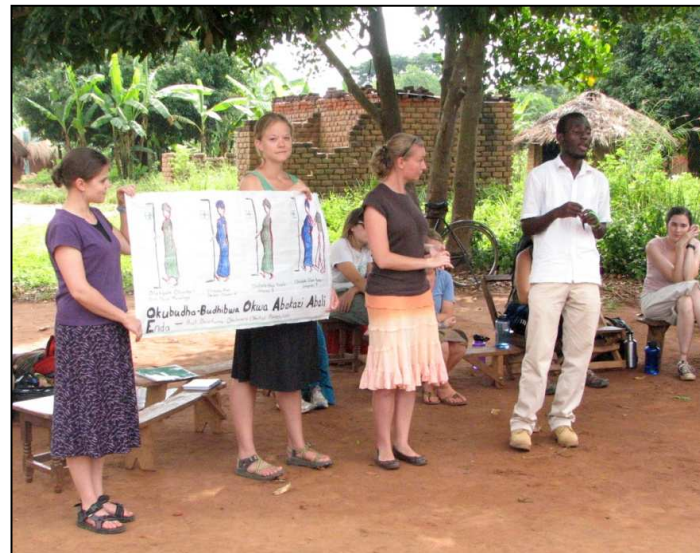
UVP eCare team conducting safe motherhood workshop in Nabitovu A

Over the summer months, UVP's volunteer Emergency Obstetric Care team – composed of doctors, medical students, and university students from the US and Uganda – conducted educational outreaches on safe motherhood in each of the 5 Healthy Villages. The village-level workshops covered family planning, antenatal care and postnatal care, nutrition, clean and safe delivery, and immunizations. The team developed a curriculum drawing from material already approved by the Ugandan Ministry of Health in order to ensure alignment with national maternal and neonatal health objectives. In order to make the information as culturally appropriate and accessible as possible, the UVP team incorporated drama as well as audience participation.